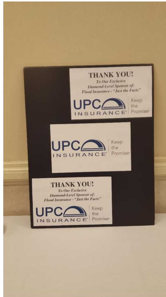
Sponsor of the Flood Insurance Class