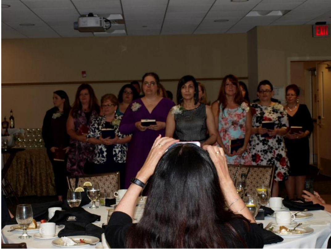
Installation of the 2016/2017 MAIW Board of Directors!