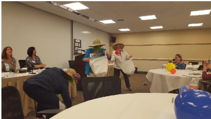
Cape Cod Chapter announcing their plans for 2017 May Association Meeting: