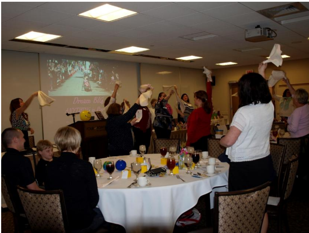
MAIW's Welcome to our First Timers!